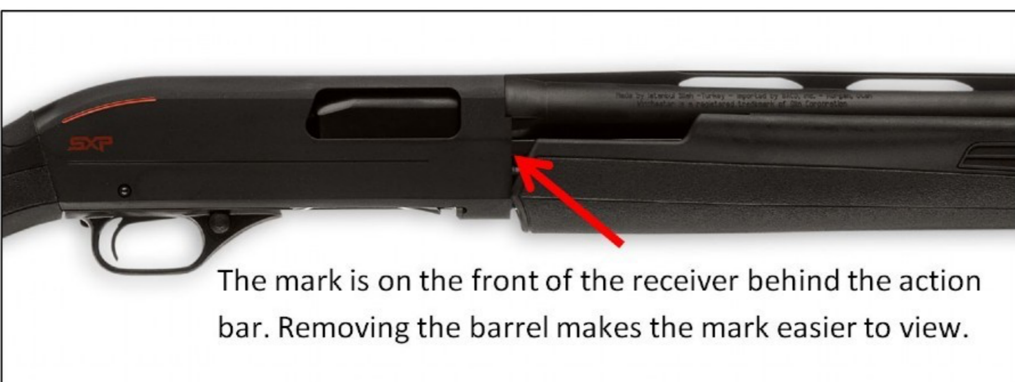
The mark is on the front of the receiver behind the action bar. Removing the barrel makes the mark easier to view.